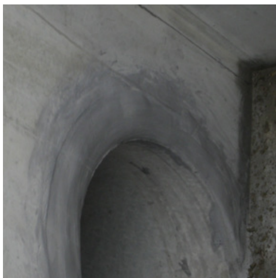
Bottom: Pipe sealing internal