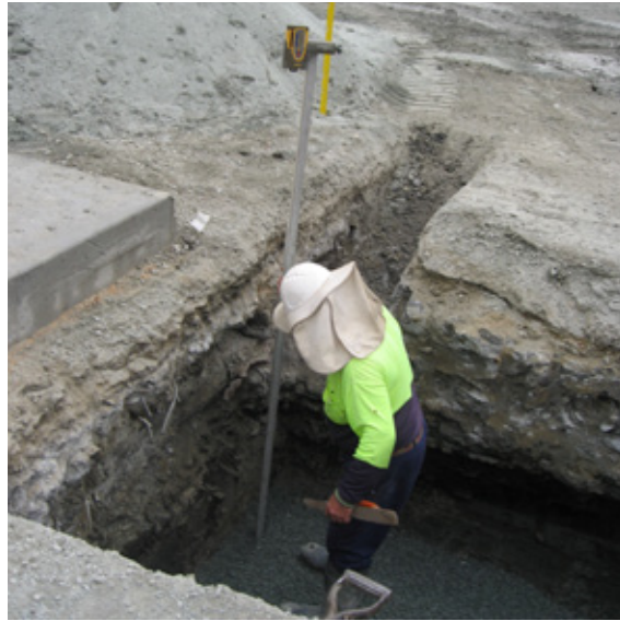
Top: Checking the foundation level