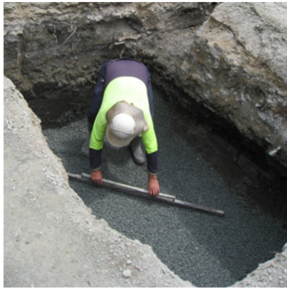
Left: Leveling the bedding

General acceptance is an approved bedding material compacted to a thickness of not less than 80 mm on an earth foundation or 150 mm on a rock foundation. The invert level of the pipe and the base thickness of the pit have to be considered when preparing the bedding (placing, leveling and compacting).