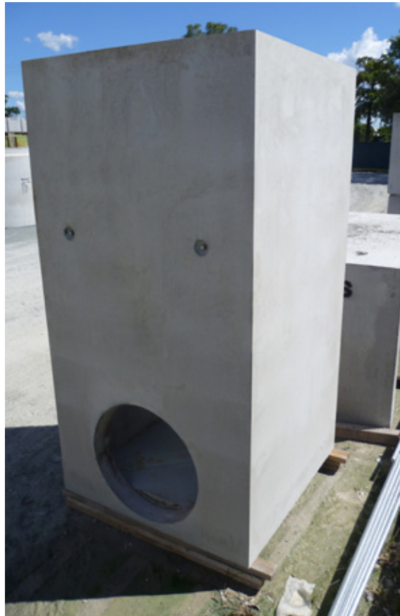
Top: Custom-made stormwater pit

Humes offers an extensive range of gullies (inlets and lintels), kerbs and barriers for roadside entry points to meet the needs of local authorities. The range is designed to suit all modern kerb and gutter profiles, and to fit on top of Humes' range of precast pits.