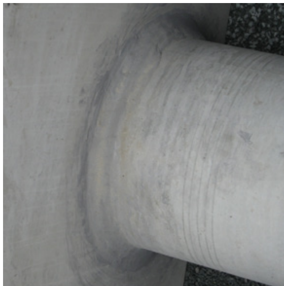
Top: Pipe sealing external