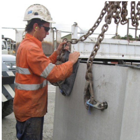
Bottom: Attaching Swiftlift® to the pit